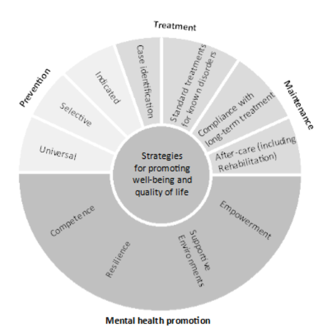
Figure 3. Modified Mental Health Intervention Spectrum (adapted from model presented by Barry, 2001)

These determinants include various social factors that influence health and mental health positively and negatively. They include factors such as income and income distribution, education, unemployment and job security, employment and working conditions, early childhood development, food insecurity, housing, social exclusion, social safety network, access to health services, aboriginal status, gender, race, and disability (Mikkonen & Raphael, 2010).